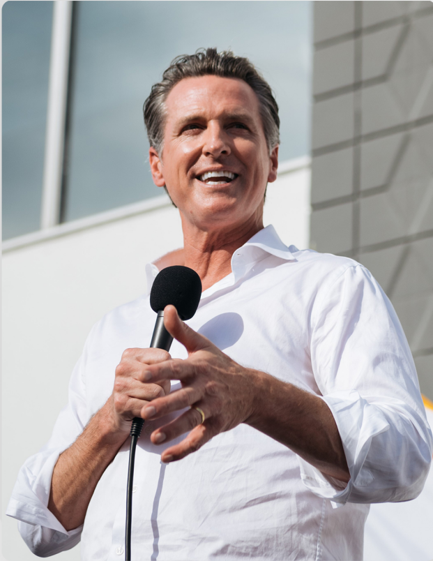
Governor Gavin Newsom